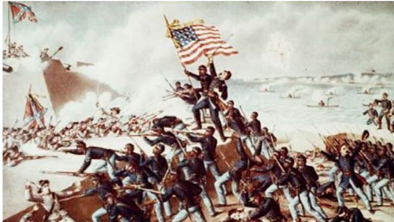
1861 Civil War